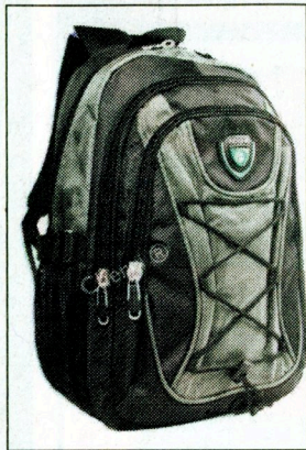
Pictures of Lachlan released by the family as well as a picture of a rucksack similar to the Lachlan used.