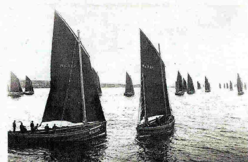
A seemingly peaceful scene at Wick