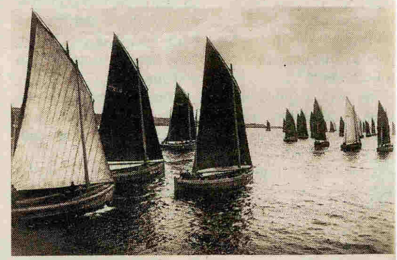
Fishing boats head out from Wick