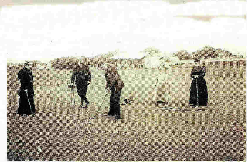
Golfers enjoy a game at Dornoch