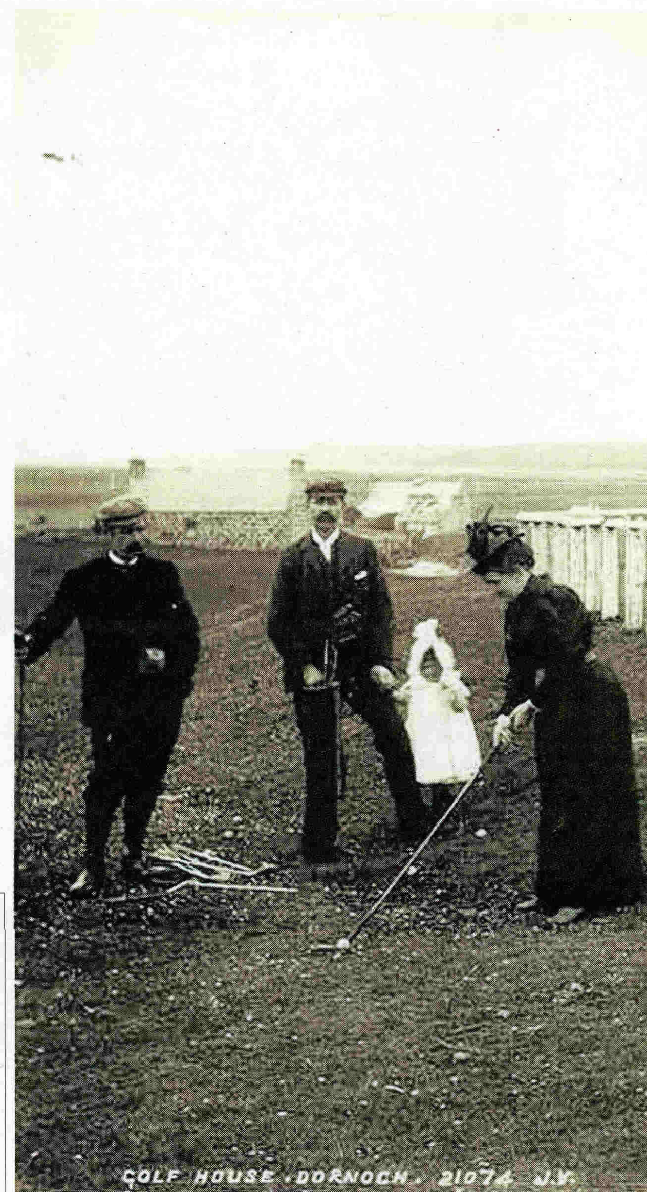
TRADITIONAL LIFE: This image of well-dressed golfers at Dornoch golf links is

He said: "My father was a handicapper at Tain golf course in the 50s. And these photos are 50 years before that."