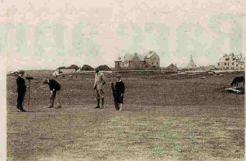
A golfer takes a shot at Dornoch golf links