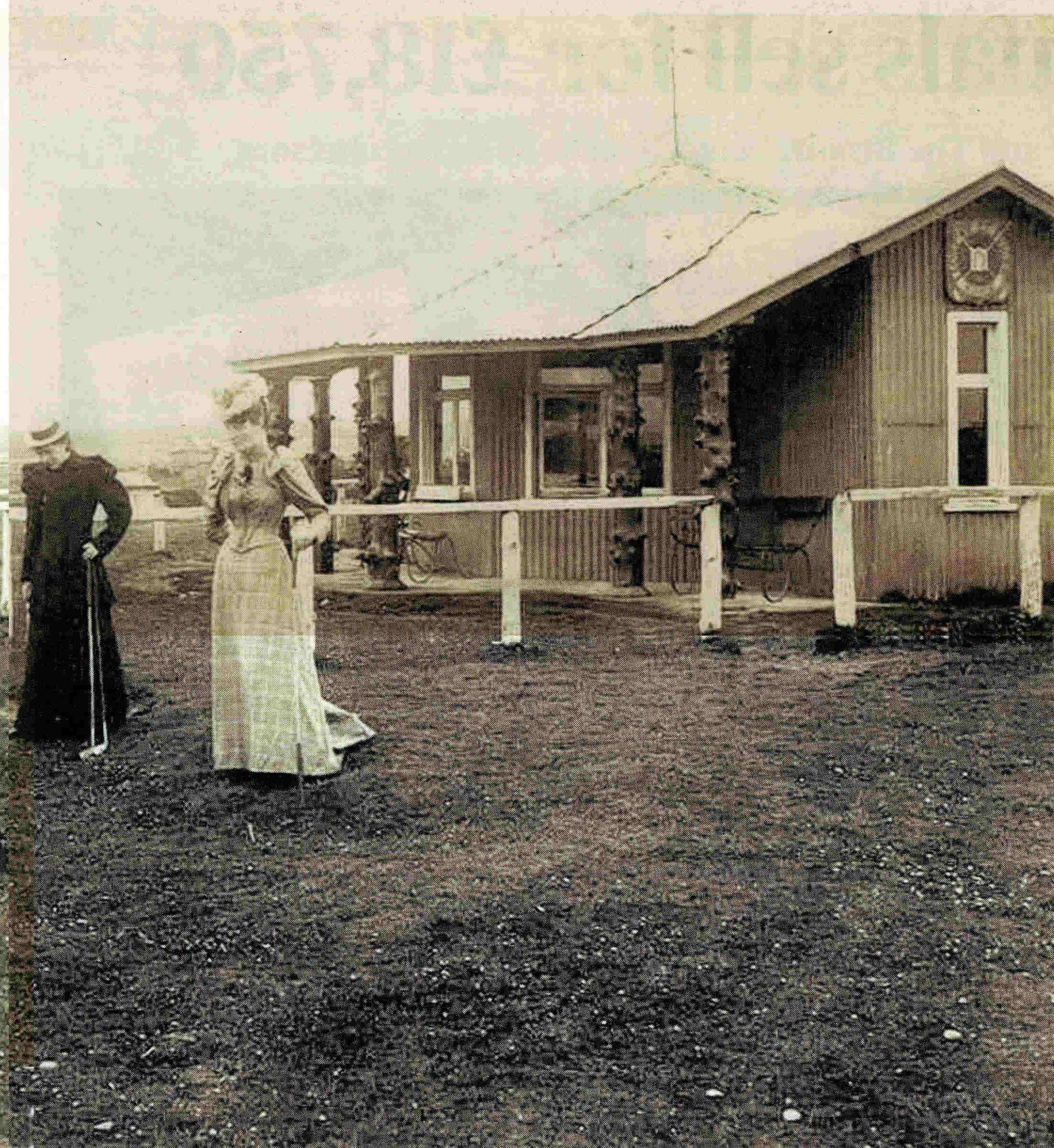
believed to have been taken in the late 1800s

Don't miss more pictures of historic life in Scotland